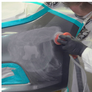
Repair Area needs to be sanded