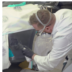
Apply one light coat