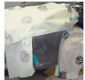
Flash off for 10 mins. before continuing