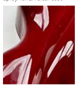
SprayMax 2K Clear coat

Surface and gloss stay the same after treatment.