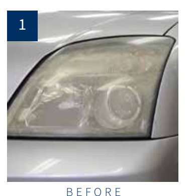
Matting / yellowing, slight superficial scratches to the coating.