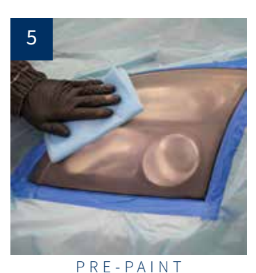
Clean surface with Wax & Grease Remover followed by use of tack cloth.