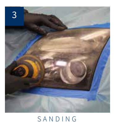
Sand evenly the entire surface of the headlight starting with P180 grit followed by: P320, P500, P800, P1000