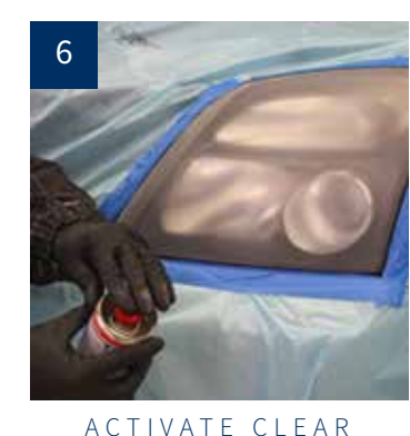
Activate 2K 2 in 1 Clear 3684068 as per instructions on can.