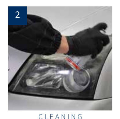
Clean the entire surface of the headlight with Wax & Grease Remover 3680094 prior to masking.