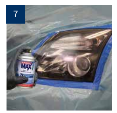
APPLY 2K 2 in 1 CLEARCOAT Apply a thin even coat of 2K 2in1 Clear 3684068. Allow a flash time of 10 min at 68°F/20°C and

apply a medium wet coat for film build and finish.