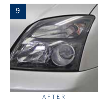
Once dry, surface is permanently sealed. If necessary, can be wet sanded and polished.