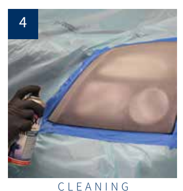
Clean surface between changes of sanding grits with SprayMax Wax & Grease Remover 3680094.