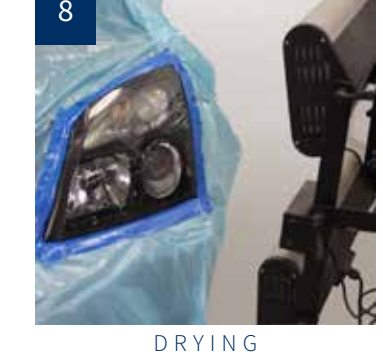
Dry at room temperature 68 ° F/20 ° C overnight or forced dry: allow to flash off for 10 min. then dry for 30 min. at 140 ° F/60 ° C surface temperature.

apply a medium wet coat for film build and finish.